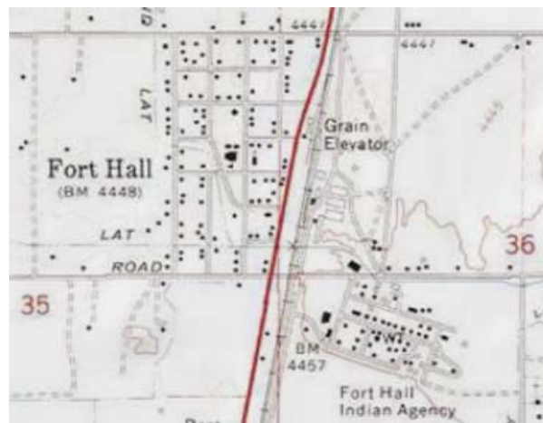
Section of 1991 Fort Hall 7.5' USGS map.

An Environmental Site Assessment (ESA) is a study conducted on a plot of land to determine the extent and nature of contamination on that site. In the first phase of an ESA, the site is examined without any actual environmental sampling of the area. This includes visual inspection of the property as well as investigation of historical documentation on the site. The EWMP currently has several ongoing and upcoming Phase I ESAs.