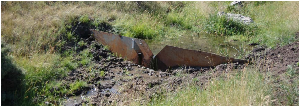
Contaminated water at a mine site in SE Idaho

All names will be kept confidential. It is important however, that we do have your name on record, in case there are any further questions we might have for you.